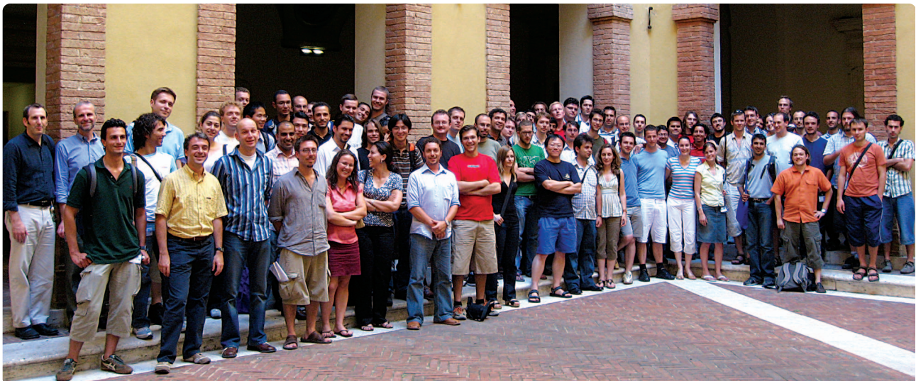
Attendants of the Second HYCON Ph.D. School on Hybrid Systems.